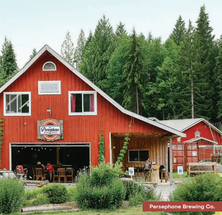
Persephone Brewing Co.